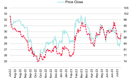
Osotspa (OSP TB)